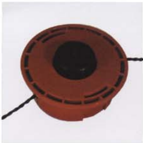
Katana Dual Tap