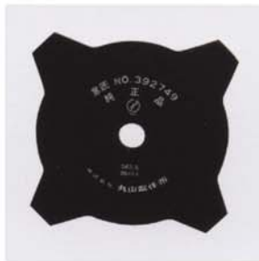
4 Tooth Blade